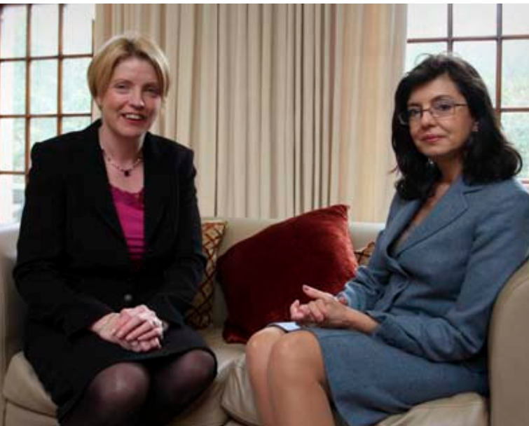
An Tánaiste and Minister for Enterprise, Trade and Employment, Mary Coughlan, T.D., and Meglena Kuneva, EU Consumer Commissioner, discussing issues relating to consumer affairs.

The Department responded to an invitation from the EU Commission to make submissions on its White Paper on Damages Actions for breach of the EC anti-trust rules. The White Paper contained a number of proposals designed to tackle obstacles to private enforcement of competition law and the difficulties involved in bringing damages claims.