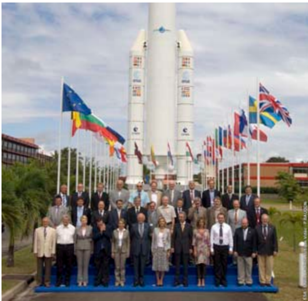
Dr Jimmy Devins, T.D., Minister for Science, Technology and Innovation with fellow European Ministers on the European Space Council in front of the Ariane 5 rocket at the space centre in French Guyana European space port.