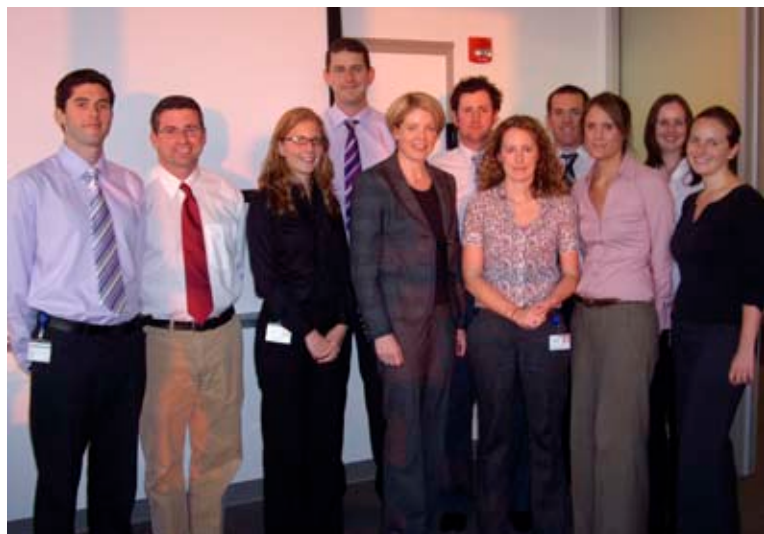
The Tánaiste and Minister for Enterprise, Trade and Employment, Ms. Mary Coughlan, T.D., met with staff from Eli Lilly's Kinsale facility on secondment at the company's corporate headquarters in Indianapolis, Indiana, during her week-long foreign direct investment trade mission to the United States.

To continue to attract high quality Foreign Direct Investment (FDI) projects to Ireland and more firmly embed existing companies in the Irish economy