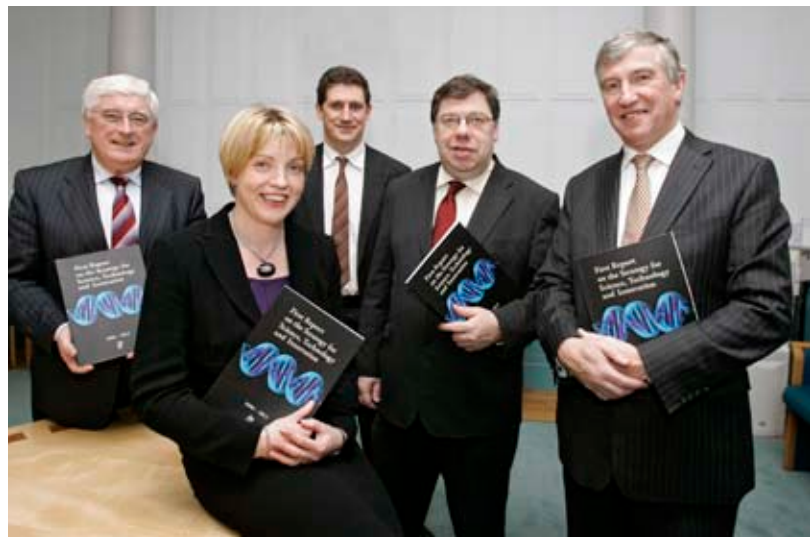
An Taoiseach, Brian Cowen, T.D., An Tánaiste and Minister for Enterprise, Trade and Employment, Mary Coughlan, T.D., Dr. Jimmy Devins, T.D., Minister for Science, Technology and Innovation, Eamonn Ryan, T.D., Minister for Communications, Energy and Natural Resources, and Batt O'Keeffe, T.D., Minister for Education and Science, at the launch of the first Report of the Strategy for Science Technology & Innovation.

During 2008, the Advisory Science Council published reports on the development of a careers framework for researchers and Ireland's international engagement in STI and, in conjunction with his ongoing role in providing scientific advice to the Government on a range of issues, the Chief Scientific Advisor played a leading role in 2008 in ensuring that Dublin's bid to host the European City of Science event in 2012 was successful.